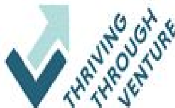
Thriving Through Venture