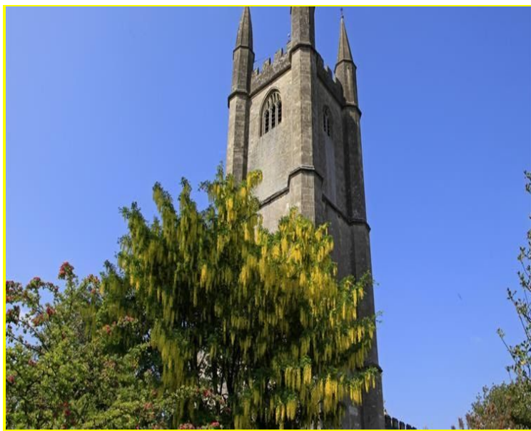
St Peter's Trust